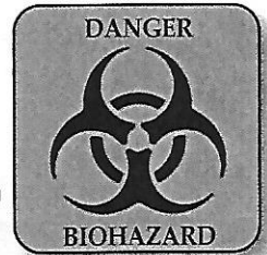
biohazard waste container